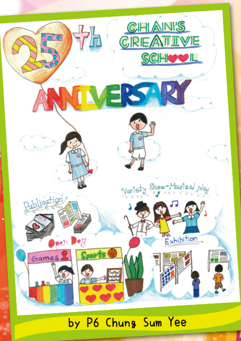
by P6 Chung Sum Yee